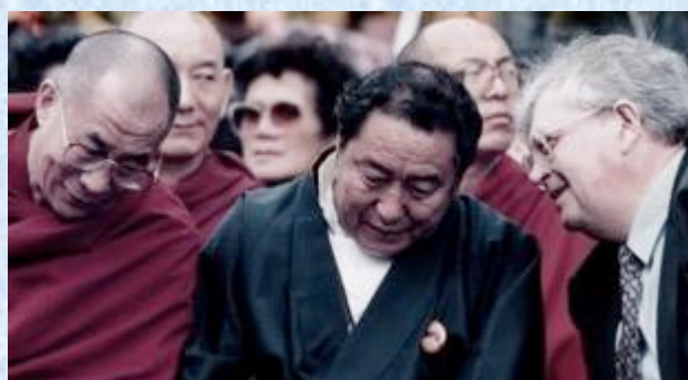
With H.H. The Dalai Lama & the PM of NZ